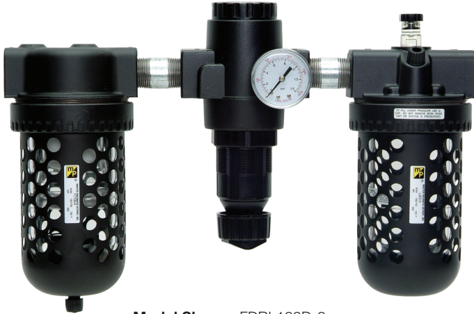
Model Shown: FDRL189D-8