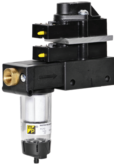
Model Shown: PC100-2