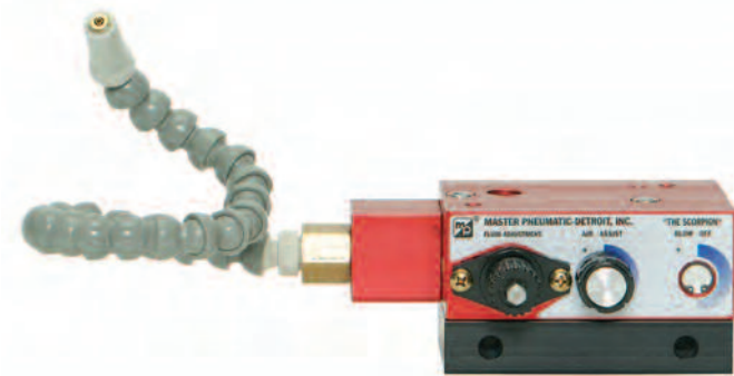
Model Shown: 8901