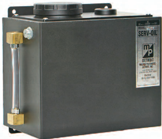
Model Shown: M473R

Servo-Meters can be supplied with oil by pressure systems ( up to 30 psig ) or gravity systems, although gravity systems are generally preferred. Remote reservoirs should be connected to the bottom port of the SERV-OIL equipment with a minimum 5/16" I.D. line.