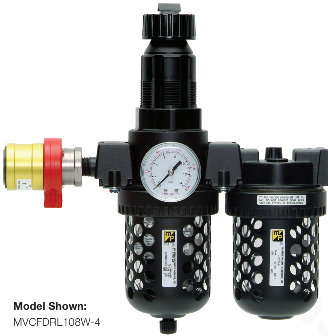
Model Shown: MVCFDRL108W-4