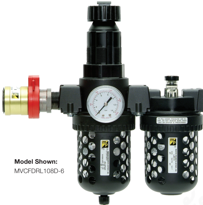
Model Shown: MVCFDRL108D-6