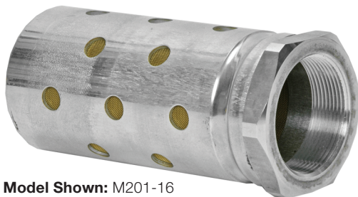
Model Shown: M201-16