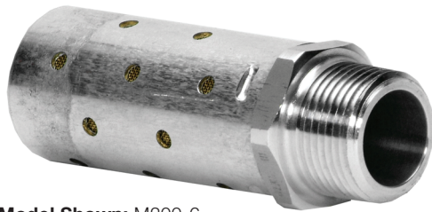
Model Shown: M200-6