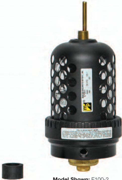
Model Shown: E100-2

When the hydro-jector is installed into a filter drain, use the supplied rubber spacer between both products. This will allow greater stability with the Hydro-Jector.