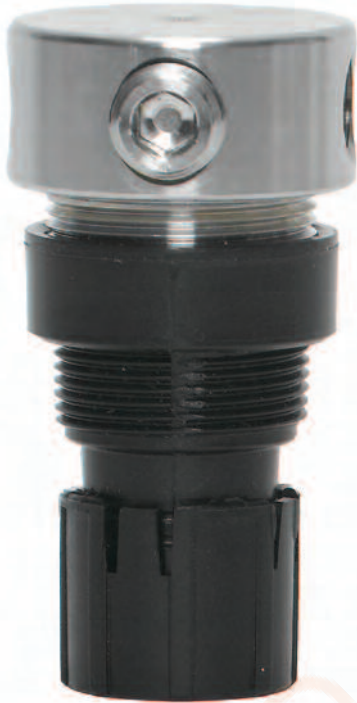
Model Shown: R56S-2VG