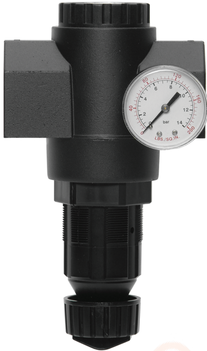
Model Shown: R180-10G