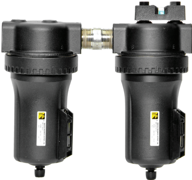
Model Shown: BDFCD100-8E8

These assemblies consist of two filters: a general purpose filter, and a coalescing filter. The general purpose filter removes gross contaminants, while the coalescing filter removes oil mists, aerosols, and minute particles.