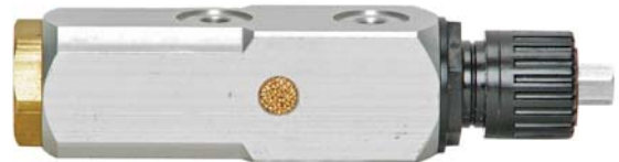
Model: 70001104A (Bolts and washers not shown)