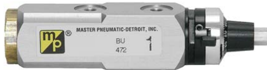
Model: 70G01104A (Bolts and washers not shown)