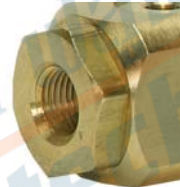
Standard end cap