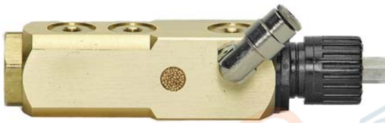
Model: 70E01104B (Bolts and washers not shown)

Fittings above are shown attached to housings that have the M5 x 0.8-6h tapped hole on side on unit.