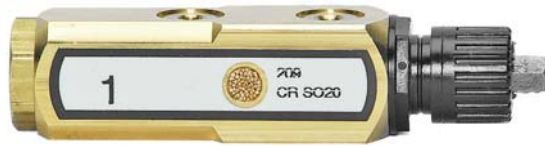
Model: 70001104B (Bolts and washers not shown)