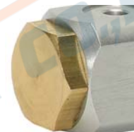
Solid end cap