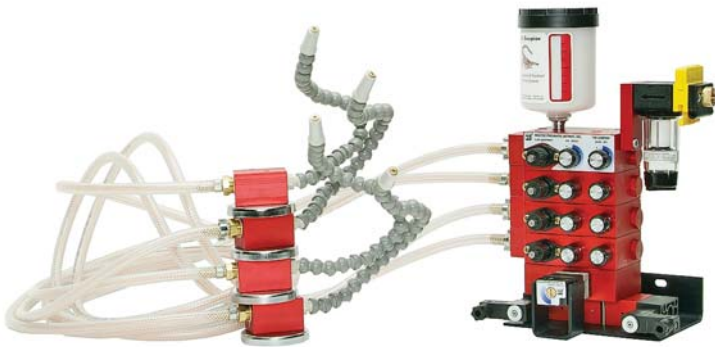
Model Shown: 8504