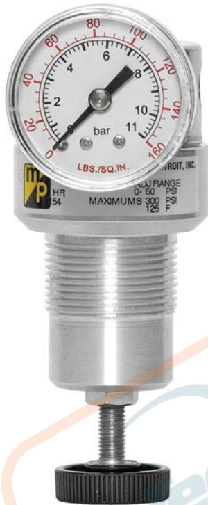
Model Shown: R57M-2G