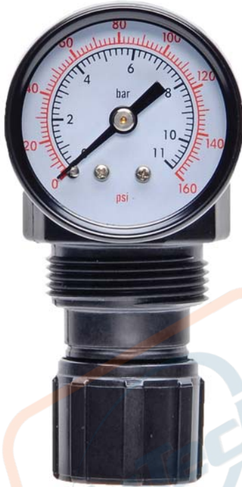
Model Shown: R56M-2G