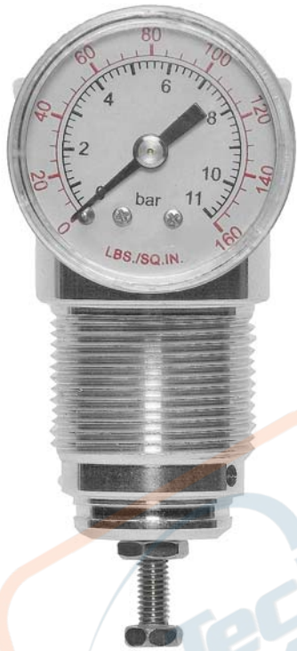
Model Shown: CX-2B0A1A0-2AG