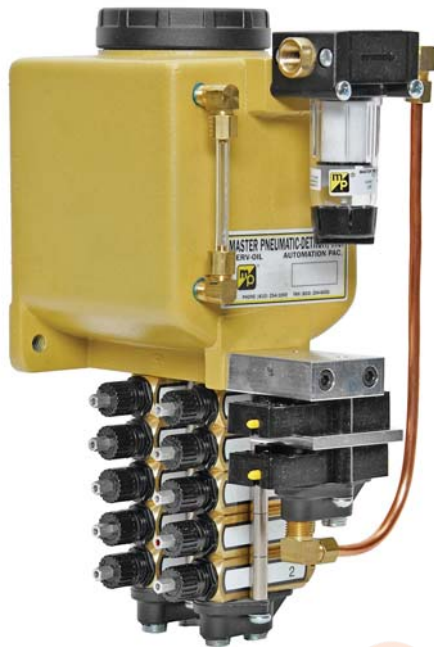
Automation Pac with Double-Counter Controller For Use with Pulse Air Inlet Source