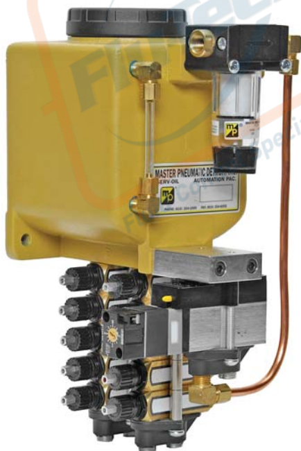
Automation Pac with Frequency Controller For Use with Constant Air Inlet Source

A SERV-OIL Automation Pac is a self-contained assembly of oil reservoir, up to 20 Servo-Meters, and a controller. It is supplied ready for installation in a pneumatic circuit, with only ball checks, fittings, and tubing being required. The Automation Pac will provide precision lubrication for up to 20 points on valves, cylinders, fixtures, automation equipment, and machine tools using pneumatic components.