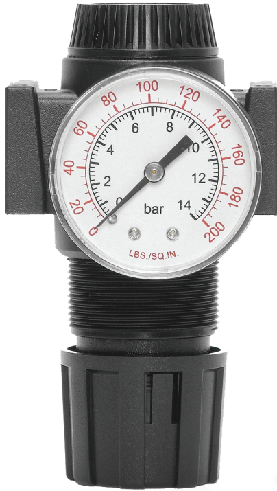
Model Shown: R60-4G