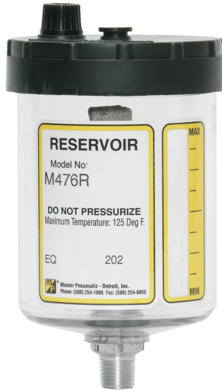
Model Shown: M476R