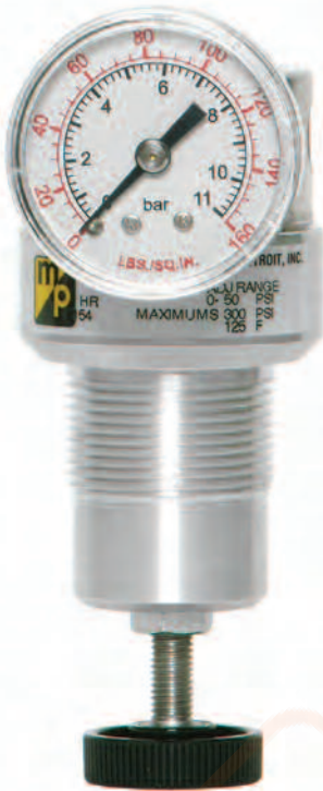
Model Shown: R57M-2G