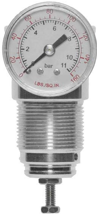
Model Shown: CX-2B0A1A0-2AG